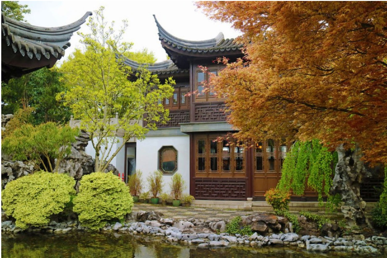
The Tao of Tea's Tower of Cosmic Reflections teahouse in Portland's Lan Su Chinese Garden, which will host a Chinese opera performance.