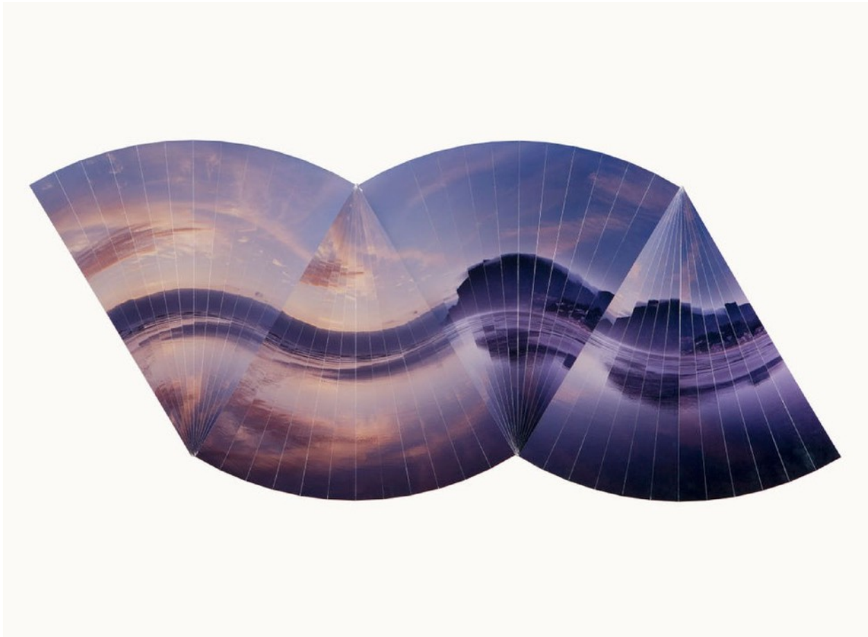
Joe Rudko, Rising Tide, 2019, found photographs on paper, 30" x 22." The work is part of the group exhibit "It's Summer!" at PDX Contemporary Art.